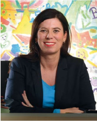
Sandra Scheeres Senator for Education, Youth and Family